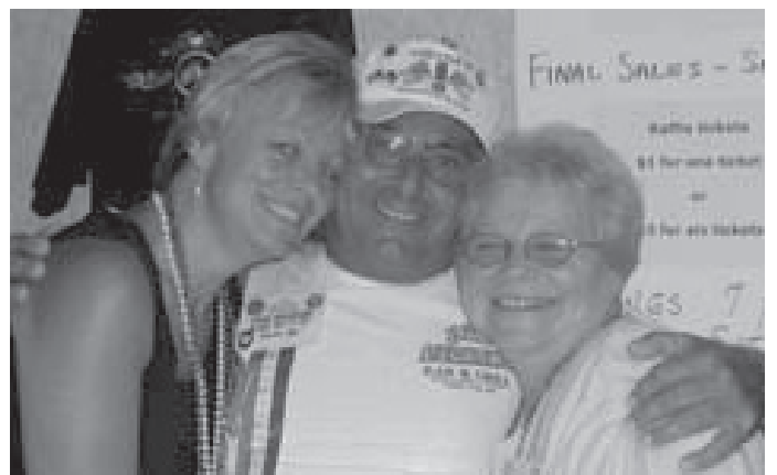
A big thanks to our raffle team!