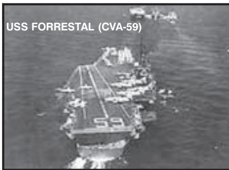
USS FORRESTAL (CVA-59)

The next segment of By Sea, Land and Air will be Rolling Thunder .