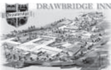
Check out the Drawbridge's website at www.drawbridgeinn.com .

10% RESTAURANT DISCOUNT IF YOU WEAR YOUR NAME TAG: A 10% discount on all meals will be available to all members and guests who enjoy their meals in