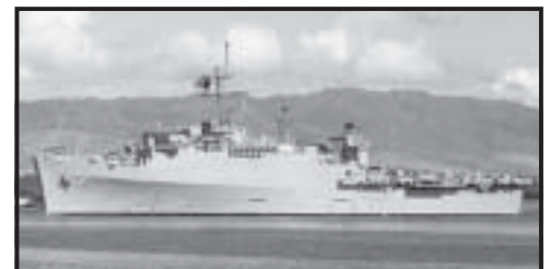
USS VANCOUVER (LPD 2) earned 11 battle stars for service in Vietnam.