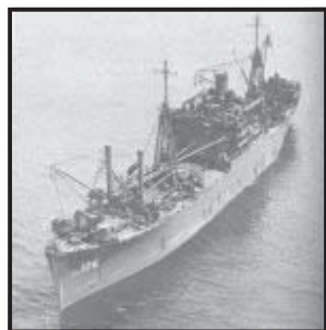
USS Union (AKA 106) was awarded nine battle stars for her Vietnam service.