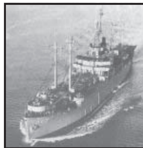
In July 1968, Mount McKinley (AGC-7) was the flagship of Commander, 7th Fleet Amphibious Force.

Fleet aircraft carried a vast array of ordnance, from Korean-era bombs to advanced missiles and precision guided munitions. For their strikes in North Vietnam, Laos, and South Vietnam, attack aircraft dropped 250, 500, 1,000, and 2,000-pound general purpose bombs, napalm bombs, and magnetic mines, and fired 5-inch Zuni and 2.75-inch high-explosive rockets. The carrier aircraft used Bullpup air-to-ground weapons, the newly developed Walleye TV-guided bomb, and